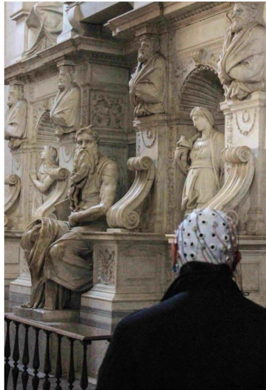
Figure 2. The second point of view (POV#2) was located on the right of the sculpture, directly towards the face of the Moses. Subjects are positioned at the same distance from the Moses that in the other points of view.

presented in the Figures 1, 2 and 3. In particular, the point of view #2 is located on the right side of the sculpture, directly in front of the Moses face (POV#2; Fig.2). The point of view #3 (POV#3) was instead located about 10 mt from the Moses face, in front of the sculpture (Fig.3). The distance of the subjects with respect to the Moses face was roughly the same for the POV#1 and POV#2 (e.g. about 5 mt) while was the double for the POV#3.