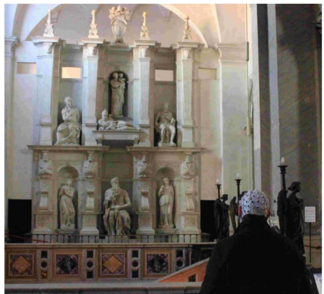
Figure 3. The subjects are positioned as a third point of view (POV#3) in the front of the sculpture, at a distance of 10 mt from the Moses.