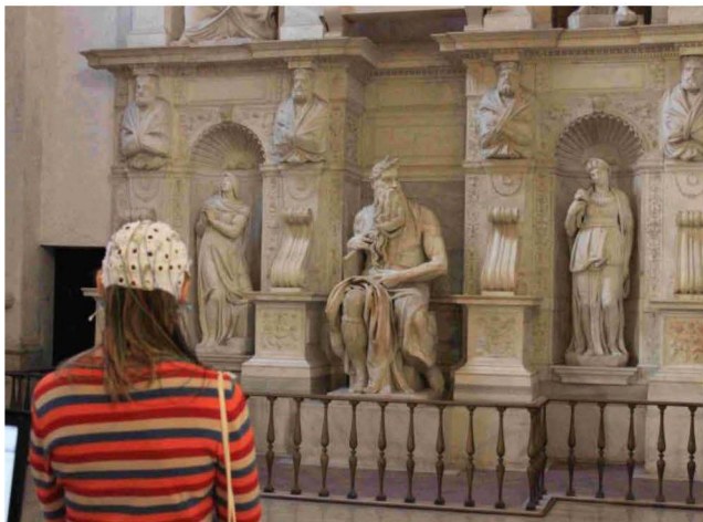
Figure 1. The subjects are positioned as a first point of view (POV#1) in the front of the sculpture, at a distance of 5 mt from the Moses.

The experiment has been performed in one of the finest church in Rome, “San Pietro in Vincoli”, in which the Michelangelo’s Moses sculpture is located. In particular, during the whole experimental session, each subject was guided through the church by an experimenter bringing her/him in front to the Michelangelo’s Moses in three different points of observation (POV) adopted. The entire experimental procedure consisted in a 1 minute resting sequence of open eyes before the visit, 1 minute baseline sequence observing a white wall within the church before the visit, 1 minute of observation in each one of the points of view considered. Fig.1 showed the position of the subject in the point of view #1 (hereafter named POV#1), at 5 mt. from the Michelangelo’s Moses.