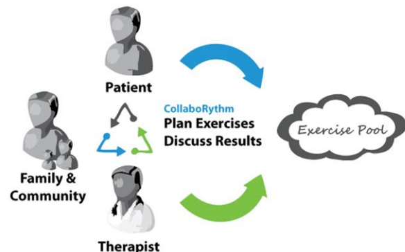
Figure 1. Schema of the user relations enabled by the system.

Furthermore, leveraging the open-source health care delivery platform CollaboRhythm [7, 8] built at the MIT Media Lab, the system allows physical therapists, patients and relatives to work remotely as a team to formulate therapy plans, discuss progress, and adapt to obstacles (Figure 1).