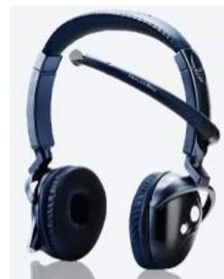
Figure 1. NeuroSky Mindset Single EEG Headset

Sleep is broken into four stages. Stage 1 is the transition from wakefulness to sleep, during which a person can be woken easily, and may not be aware that they were sleeping. Here, EEG signals are low amplitude and low frequency. During stage 2 sleep, body temperature decreases and the heart rate slows. In stage 2, alpha waves are periodically interrupted by alpha spindles which are 12-14Hz bursts of brain activity that last at least half a second [7]. Stages 3 and 4 are progressively deeper stages of sleep. Rapid Eye Movement (REM) sleep follows stage 4. During REM sleep, dreaming occurs and brain activity increases. The sleeper continuously cycles through each of these stages throughout the sleeping period.