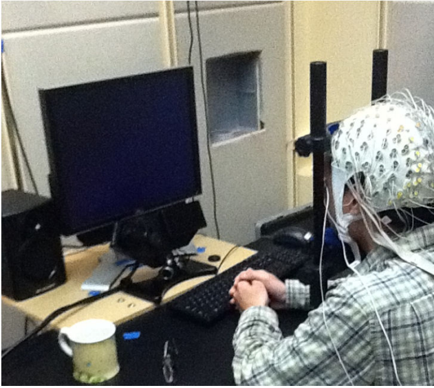
Fig. 1. Experimental setup. We recorded EOG, EEG (not used in the current analysis), and video based eye-tracking data, while the subject played the “friends and foes” gaze contingent computer game.

SR Research Ltd, Mississauga, Ontario, Canada), which was used to control the gaze contingent “friends and foes” game.