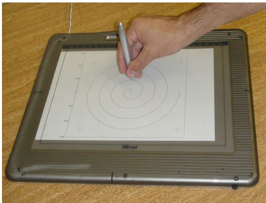
Figure 1. Digitizing tablet with the standard drawing pattern fixed on its surface. In this study, the selected drawing pattern is the Archimedes' spiral.

The first sample was collected with the subject drawing the spiral from its center to its extremity (outgoing spiral - OS), whereas for the second sample the subject drew the spiral from its extremity to its center (ingoing spiral - IS). This procedure was repeated three times for each subject. The subjects were asked to draw the spiral at their natural speed. The collected spirals were digitized at 64 Hz through a digitizing tablet (Trust, model TB-4200) with resolution of 120 lines/mm.