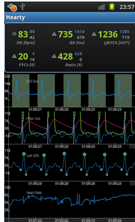
Fig. 3. Screenshot showing the main interface of the application

A GUI was implemented, which allowed starting and stopping the processing and visualization of the results (Fig. 3). To allow efficient plotting of signal data with high sampling rates, a specialized plotting component was implemented. Line-plots representing the raw ECG signal, extracted QRS complexes and variation of heart rate were displayed in the bottom area. Every time a QRS complex was detected and classified, it was marked either in green (normal beat) or red (abnormal beat). Additionally the current value of different features like heart rate, R-R interval in ms and number of recognized QRS complexes was displayed in the upper area. Upon closing an overview of the classification results was displayed.