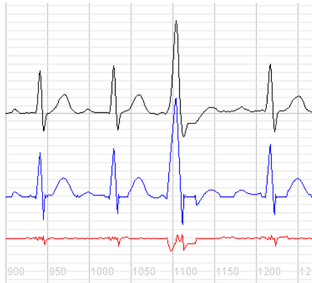
Figure 2. ECG signals with appropriate model and difference.

sign. The QRS boundaries points represent the Q and S peaks. To avoid potential classification errors due to noise and jaggy peaks in the signal, the changes in the signal have to be above the threshold for six consecutive samples after the QRS lines boundary. The line slope is estimated over four samples. The selected number of samples (6 and 4) over which the thresholds were calculated were determined empirically as the values that provide the best accuracy in the presence of noise and artifacts in the ECG signal. The QRS model features are displayed on Fig. 1.