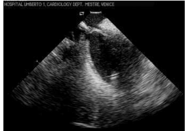
Figure 1. ICE image of the catheter tip at the LIPV ostium.

A landmark point acquired at the inferior border of the LIPV ostium under ICE and fluoroscopic guidance (Figure 1) was inserted into the CT image. Another 7 – 12 points were acquired under ICE guidance at the posterior wall of the left PV antrum, where ablation was to be performed. The anterior side of LPVs was avoided, in order to obviate the potential difficulty of discerning the position of the ablation catheter tip in relation to the vein and the left atrial appendage. In addition, it may be difficult to keep the ablation catheter in a stable position on this ridge. For each right PV, 4 – 7 points were acquired at the possible ablation site in both the posterior and septal walls. No points were acquired in other areas (Table 3). As the points were acquired, care was taken to maintain perpendicular contact between the catheter tip and the endocardial tissue. Once a good atrial signal was obtained from the ablation catheter, the surface points were acquired and registration was performed. Figure 2 shows the area of the registration points.