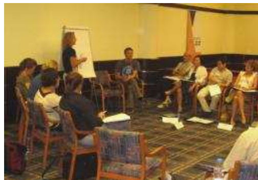
Figure 1. The Scientific Summer School in Turkey (SSSiT), 2007.

The purpose of the present study was to evaluate the effectiveness of preparation during the month prior to the SSSiT using an on-line Research Methodology Guide and ORP outline.