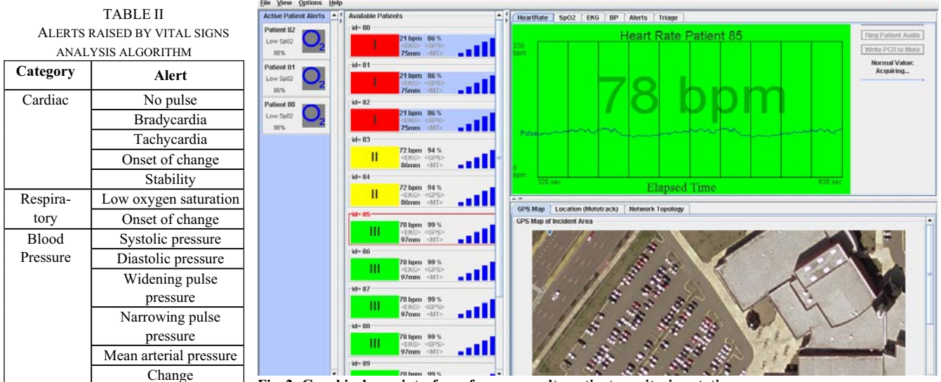
Fig. 2: Graphical user interface of mass casualty patient monitoring station.

In addition, we use a low-power alternative to localize patients to general localities of a particular area of the disaster scene (such as treatment or decontamination area), an ambulance while being transported, or an admitting care facility. Tag locations are calculated by their proximity to: base stations laptops installed inside ambulances, at care facilities, and at designated areas of the disaster site. Mobile laptops are equipped with SiRFstar III GPS receivers to detect its location, while stationery laptops allow users to manually specify the location from an options menu. Hence, the medic can track the general locality of the patient based upon the base station the triage tag is reporting to.