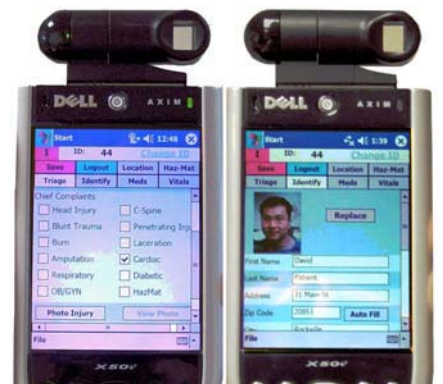
Fig. 3 PDA shows screens for inputting chief complaint (left) and for capturing patient photo (right)

The PDA, Fig. 3, is developed to facilitate incident information documentation and communication. As a lightweight alternative to the laptop, the PDA provides a portable means of viewing real-time sensor readings of patients. Furthermore, it includes a camera, a Bluetooth barcode scanner, and a Bluetooth SiRF III GPS to facilitate rapid data capture. It improves the process of reassessing and matching patients to resources by allowing responders to quickly record patient identification information, triage details, treatments, photographs, and locations. The inputted data is immediately transmitted to a remote server for further dissemination. The barcode scanner improves the process of manually recording patient identification details by allowing responders to scan the 2D barcode on patients' driver's licenses. Data from the barcode is parsed with the PDF417 encoding standard.